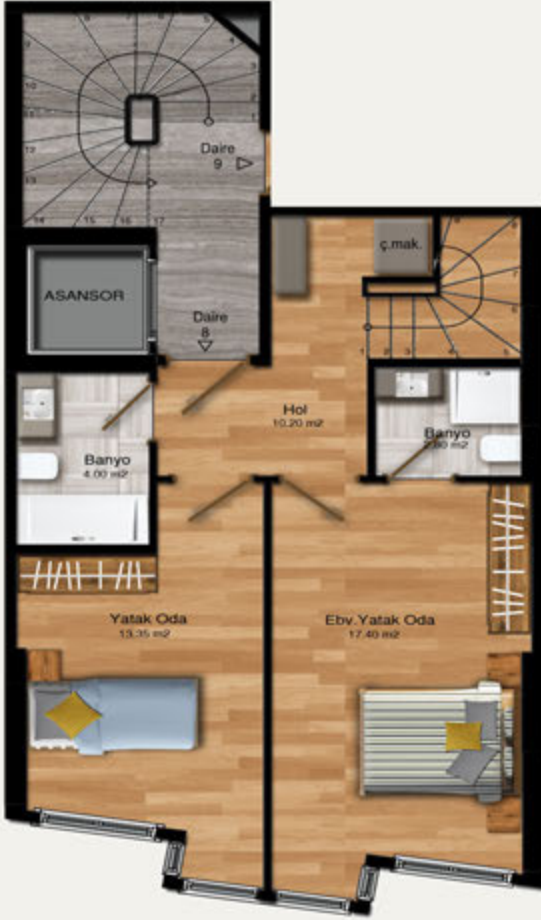
Dubleks Alt Kat