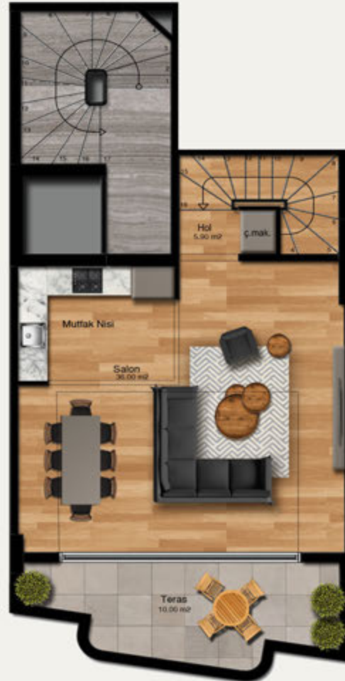
Dubleks Üst Kat